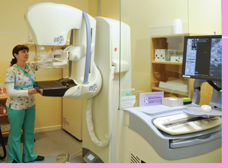
What is a Digital Mammogram?

Digital Mammography is a low dose x-ray that is used to take computerized images of the breasts. Physicians use these images to help detect and diagnose breast disease in women.